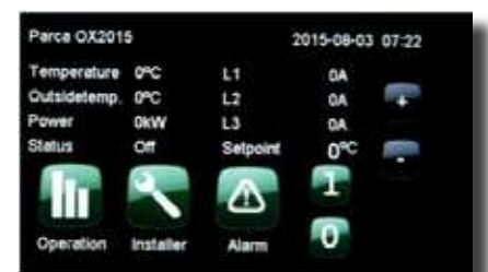
Eco series touch screen